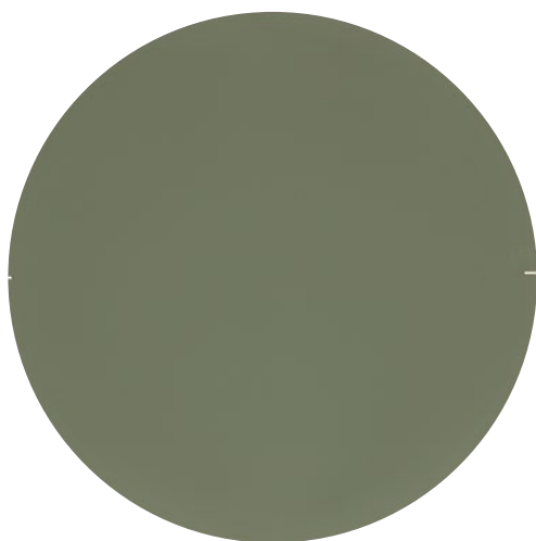
UrbanPola™ lens with PET Polarized film

(Soaked in room temperature tap water for 100 hours)